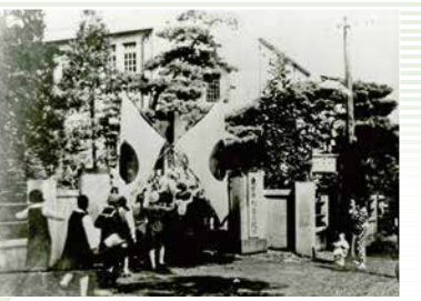
Parade celebrating establishment of Suginami Čity (1932)

school unique to Suginami City (first in Japan)