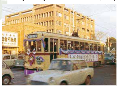
Street car commemorating the closure of the Toden Suginami Line (1963)