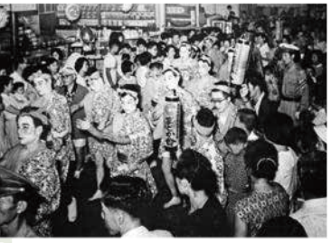
2nd Tokyo Koenji Awa-Odori Festival (1958)