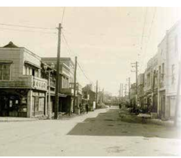
Vicinity of Ogikubo Station North Exit (1944)