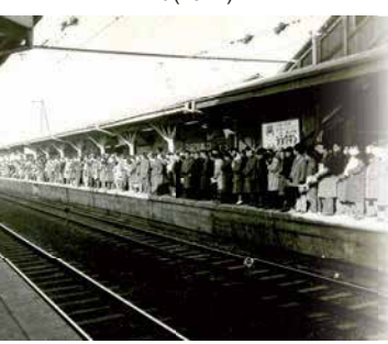
Asagaya Station during morning rush hour (1961)